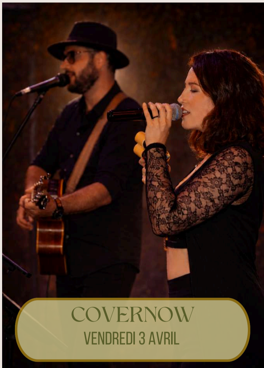
COVERNOW VENDREDI 3 AVRIL